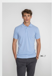
PRIME MEN 00571