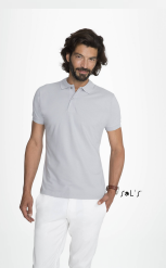
PERFECT MEN 11346